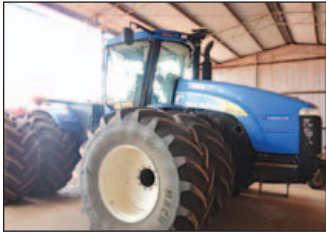
NEW HOLLAND T9050 , powershift, hyd PTO, 800/70R38 duals, 2009 mod, steer ready, 1450 hrs. $198,000 (M)