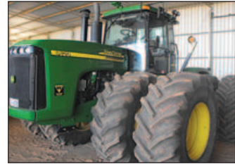
JOHN DEERE 9620 , 1875 hrs, 800/70R38 duals, powershift, weight kit. $231,000 (C)