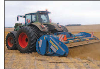
IMANTS SPADERS , 2 in stock with trailing kits, 4.5 metre. SPOA