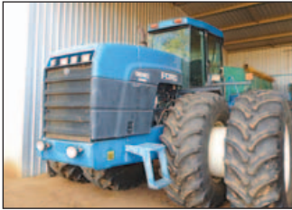
VERSATILE 9680 , 6185 hrs, 710/70R38 duals, powershift. $66,000