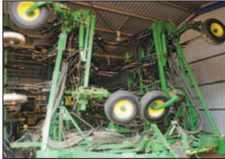
JOHN DEERE 1870 , 56ft Conserva Pac, 12" spacings. $137,500