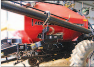
CASE ADX2180 , variable rate, TBT, 4 seasons. $39,600