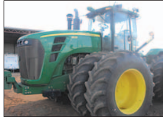
JOHN DEERE 9530 , 1674 hrs, 710/70R42 duals 70% tread, powershift, autotrac ready. $231,000 (TS)